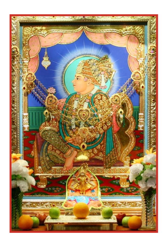
| Jay Shree Swaminarayan |