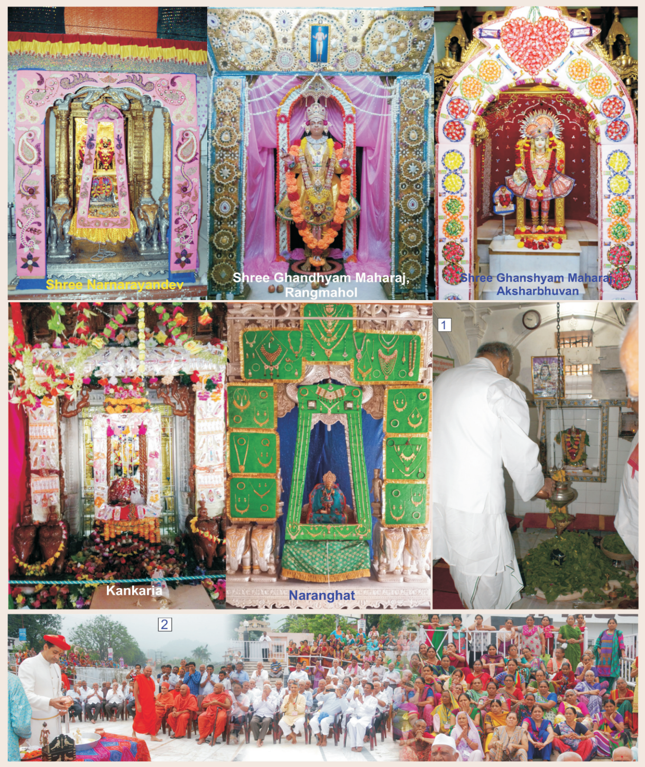
1. H.H. Shri Mota Maharaj performing poojan of Shivlinga of Prasadi in Naranghat temple during the pious Shravan Maas.2. H.H. Shri Achayra Maharaj performing Abhishek of Thakorji in Rishikesh on the bank of pious river Ganga organized by Shree Swaminarayan temple, Naranpura, and saints and haribhakas relishing Satsangijivan Parayan.