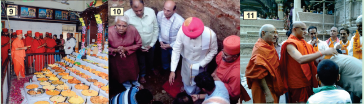
(1) H.H. Shri Acharya Maharaj performing aarti in Shree Swaminarayan temple, Bhaopura on the occasion of Patotsav. (2) H.H. Shri Acharya Maharaj performing Annakut Aarti in Shree Swaminarayan temple, Approach, on the occasion of Patotsav. (3) The host devotee of Katha performing aarti of H.H. Shri Acharya Maharaj in the Sabha at village Ridrol. (4) H.H. Shri Acharya Maharaj performing Vyas-poojan on the occasion of Patotsav of Shree Swaminarayan temple, Balasinor. (5) H.H. Shri Acharya Maharaj performing invocation of idol images and offering holy-fruit in Shree Swaminarayan temple, Sughad. (6) H.H. Shri Acharya Maharaj performing aarti of Thakorji in Kothamba temple on the occasion of Patotsav. (7) Annakut Darshan in Balva Temple, on the occasion of Patotsav. (8) H.H. Shri Mota Maharaj performing poojan of Things of Prasadi at the residence of the great devotee Kasalibai in Mahesana and performing aarti of Thakorji in Shree Swaminarayan temple, Mahesana, on the occasion of Patotsav. (9) Mahant Swami Shastri Harikrishnadasji of Ahmedabad temple performing Annakut Aarti in Kalol Shreenagar temple on the occasion of Patotsav. (10) H.H. Shri Acharya Maharaj performing ritual of Khat-Muhurt of new temple at village Sadra. (11) Mahant Swami Shastri Harikrishnadasji of Kalupur, Ahmedabad temple and Mahant Swami Devprakashdasji of Naranghat temple performing Swagat of Padyatri-devotees of Dholka-Kalupur Padyatra organized on the occasion of Shree Namarayandev Mahotsav.