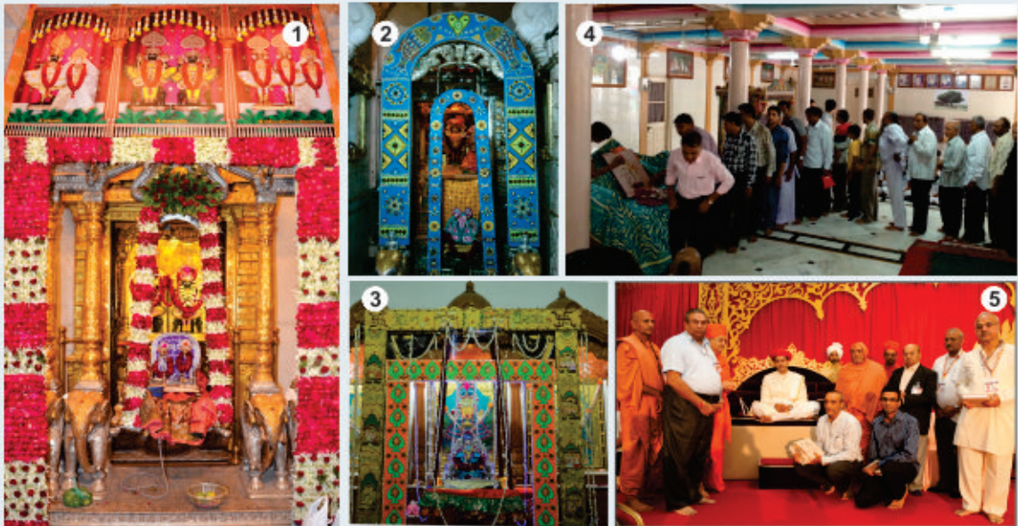
Programmes in various temples-village on the occasion of next 41 st Janmotsav (Dashera) of H.H. Shri Acharya Maharaj