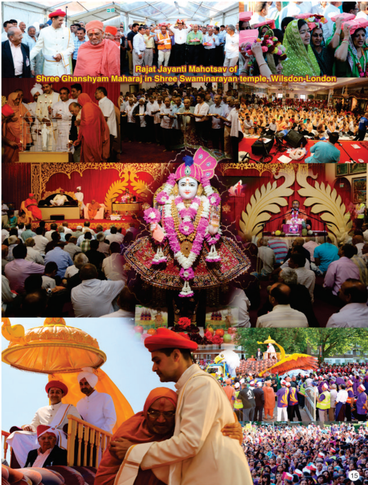
Rajat Jayanti Mahotsav of Shree Ghanshyam Maharaj in Shree Swaminarayan temple, Wilsdon-London